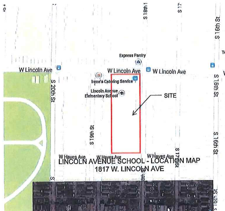
LINCOLN AVENUE SCHOOL - LOCATION MAP 1817 W. LINCOLN AVE